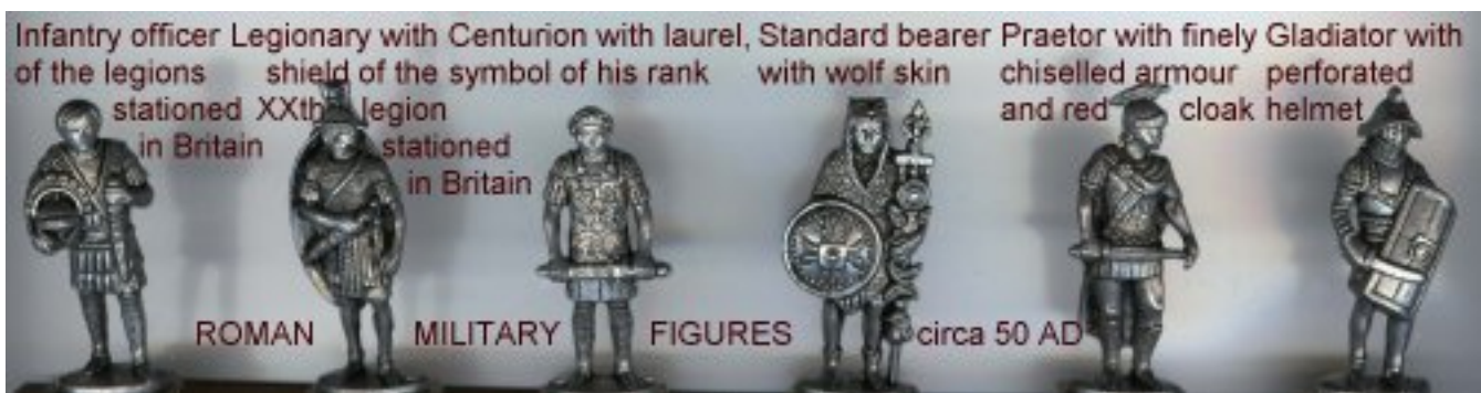
Click on figure to enlarge

Needless to say it is now comparatively easy to complete the first three with all the present technology, but the Millennium is more exacting so it is a better challenge.©